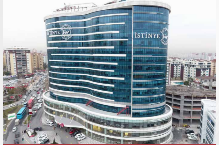
Liv Hospital Bahçeşehir Istinye University Hospital