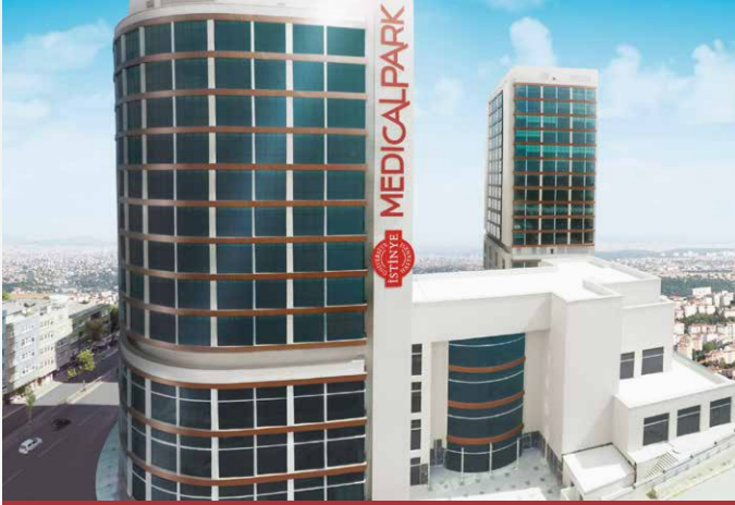
Medicalpark Gaziosmanpaşa Istinye University Hospital