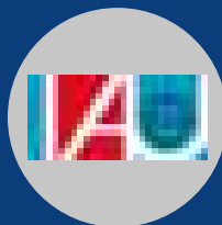
International Association of Universities