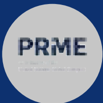
United Nations Principles for Responsible Management Education