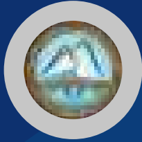
Balkan Universities Association