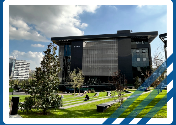
VADI İSTANBUL CAMPUS